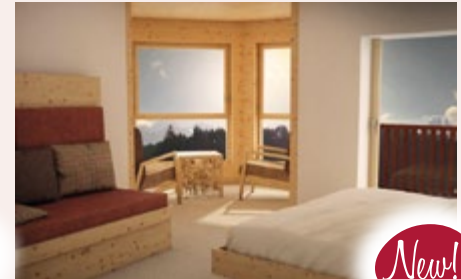
BIO de luxe double room Merl (ca. 34 qm)