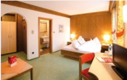
Classic double room Oartl (ca. 22 qm)