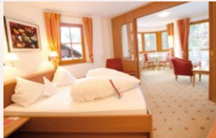
Suite Wallner (ca. 40 qm)