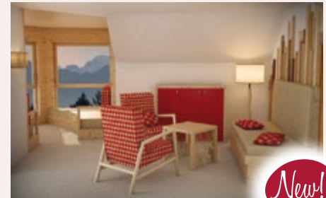
Panoramic Suite Roarer (ca. 52 qm)