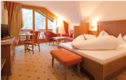
Superior double room Windspiel (ca. 35 qm)