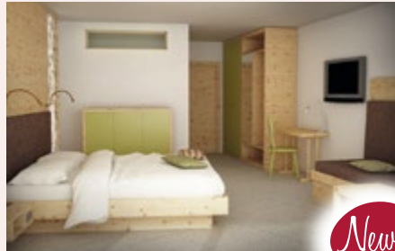
Nature Design double room Mitterstieler (ca. 28 qm)